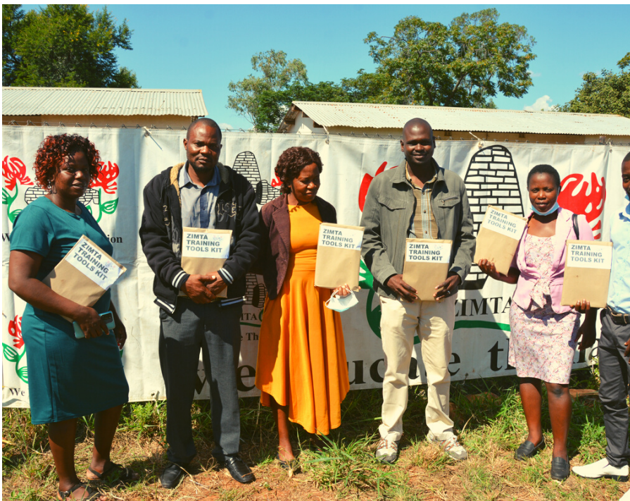
Educators in ZIMTA

The Educating for Strength and Growth Activity was conducted during the months of March and April at ZIMTA Ehlekweni Vocational Institute (ZEVI) with the aim of equipping recently elected school representatives with various skills, whilst also strengthening the union's grassroots levels. The school representatives were drawn from various provinces.