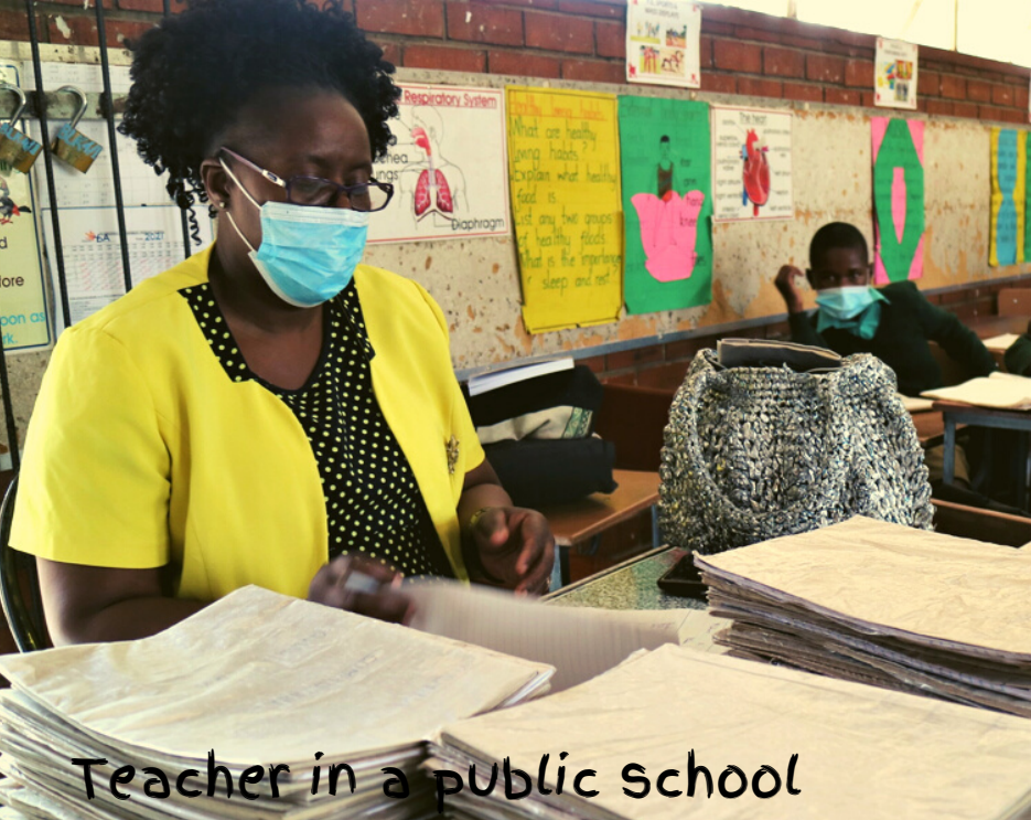
Teacher in a public school