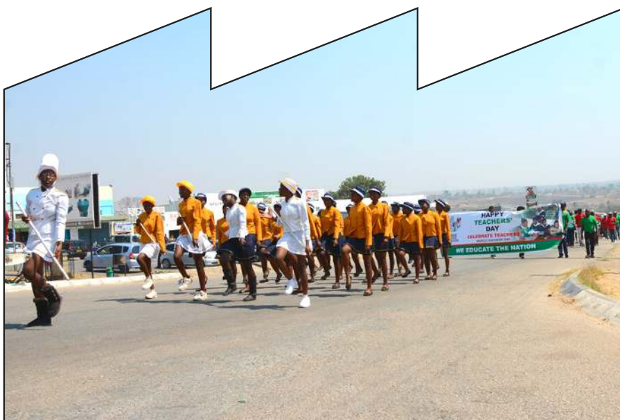
Drum Majorettes Marching

Commenting on the side-lines, some teachers expressed gratitude and thanked ZIMTA for bringing them together once more to take stock of their needs and welfare issues under the banner of World Teachers Day, celebrated annually and officially on October 5.